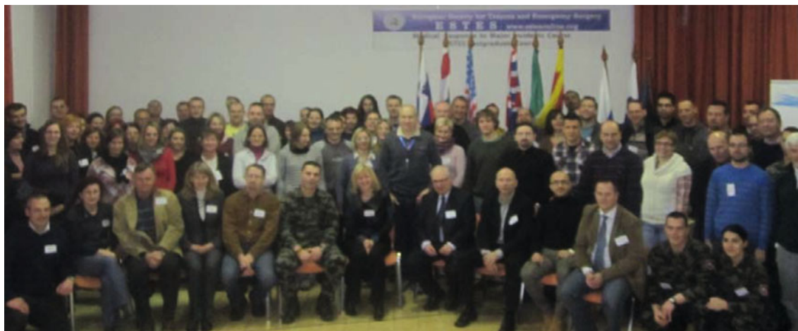
MRMI course Slovenian Army Base

The third Slovenian-Croatian MRMI course under ESTES endorsement was held in the Slovenian Army Base in February 2013. The Croumsa and Slovenian Surgical Association together with the newly founded society Slovenian MRMI Association continue with the education project on disaster preparedness for two neighbouring states. More than 60 participants from two countries attended the course under the leadership of the international MRMI faculty.