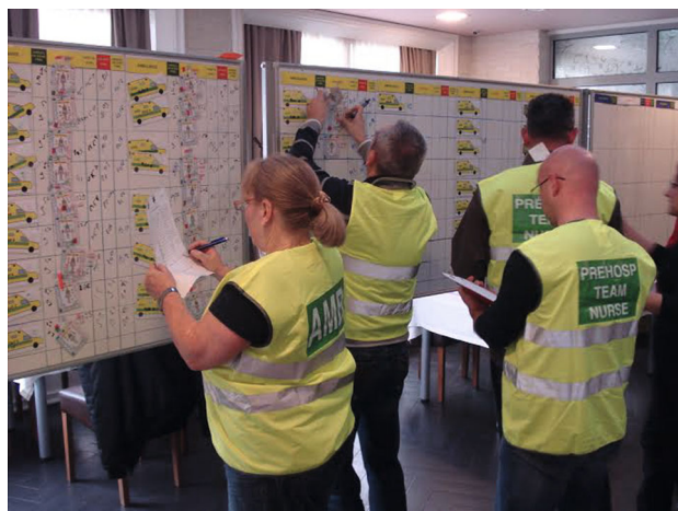
Picture: MRMI Course – Slavonski Brod, Croatia, November 15–17, 2013

The national Croatian MRMI course was organised in Slavonski Brod, November 15–17, 2013 under the auspices of the Croatian Ministry of Health.