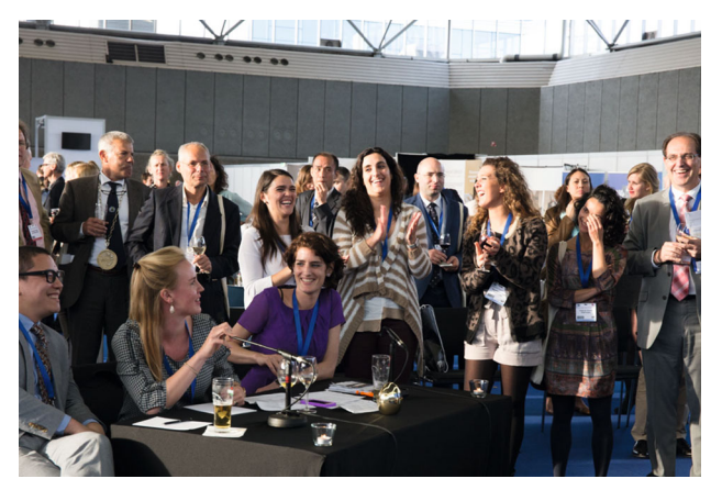
Figure 2: Cheese and Wine Session

One of the novelties of this year's congress was the "Cheese and Wine Sessions." A session where, at the end of the day, selected presenters of a poster got the opportunity to explain their project in a short bullet talk, in an informal but competitive way.